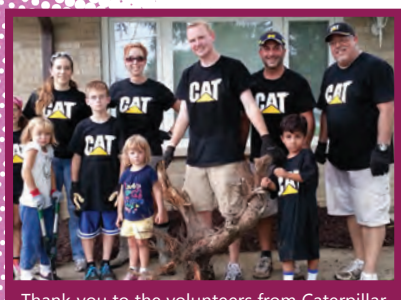
Thank-you to the volunteers from Caterpillar who helped remove tree stumps and improved the look of our group homes. We appreciate your time and effort!